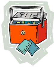
Table Arrangement, Beverage Coolers, Garbage and Recycle Bins

How many of these items are needed and where in the house will you place them?